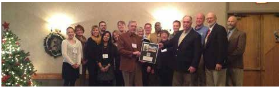
Managers and staff of Capitol Region Watershed District accept the 2014 Project of the Year award at the MAWD Annual Meeting banquet.